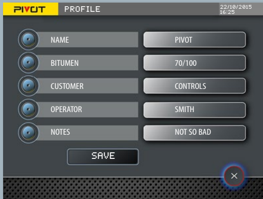
Calibration of the contactless displacement transducer