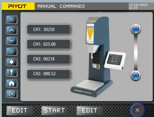
Alternative manual adjustment of the needle position