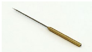
81-B0113, penetrometer needle

Verified penetrometer needle 2.5 \pm 0.5 g. fully hardened, tempered and polished stainless steel. Conforming to ASTM D5 and EN 1426. Supplied complete with official UKAS Verification Certificate.