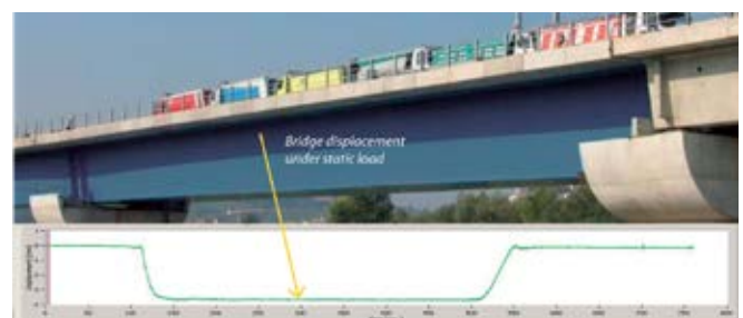
IBIS-FS static bridge monitoring