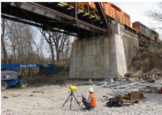
IBIS-FS monitoring an iron bridge