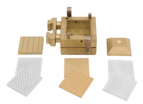
Shear box assemblage

Please see Shear Box assemblage to the right.